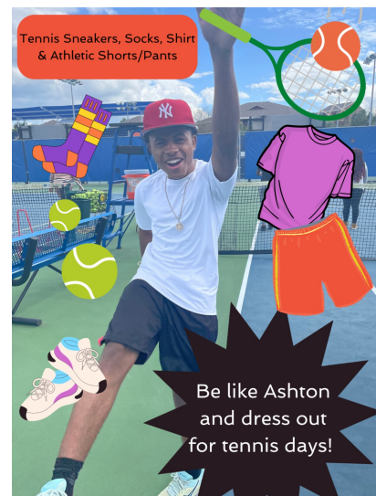
Tennis Sneakers, Socks, Shirt & Athletic Shorts/Pants